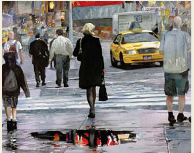
Times Square Umbrella II